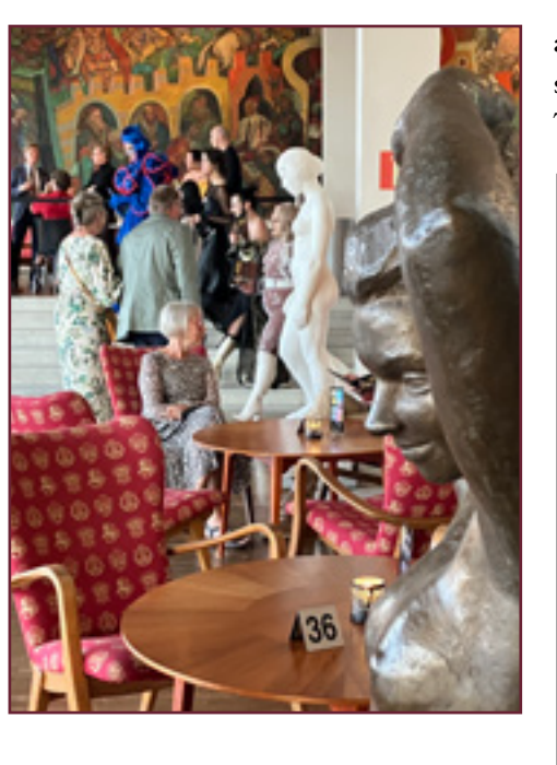
Malmö Opera, Stage (left) and Foyer, decorated with art as a café-restaurant. Visitors come to dine and chat in this inviting ambience long before the performance.

known theatrical characters of the fountain were magically illuminated from the blazing wreath of fire above their heads. The reflection of the fire in the flowing water made the figures appear alive. \Box