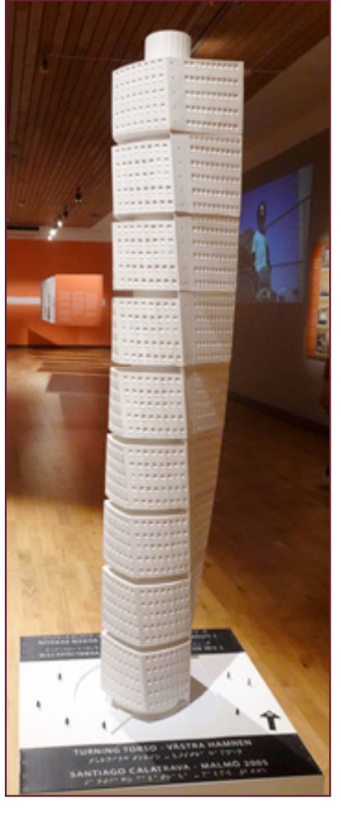
Turning Torso: the high-rise building as a model and as a diagram (right).

The quickest way to get to Malmö from Central Europe is by plane via the Danish capital, i.e. via Kastrup Airport. Uplifting to float over the water and see ships draw their lines.